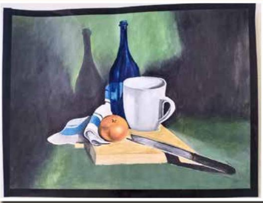
Shrijeet Yande X A