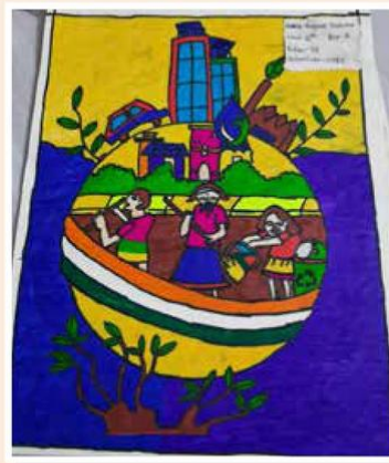
Rajveer Ponkshe VI A