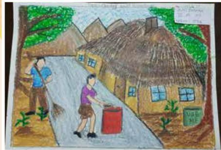
Sahil Behera VI A