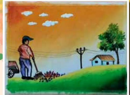
Shreya More VI B