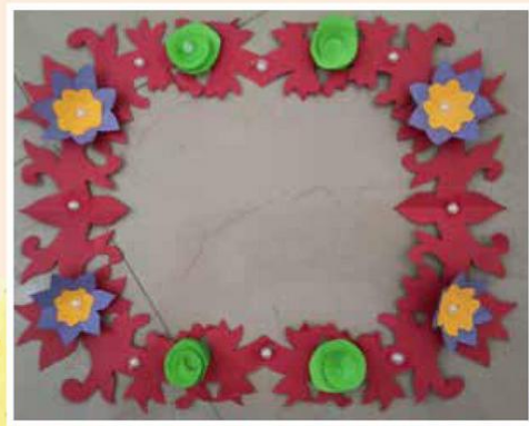
Nidhi Sancheti VII B