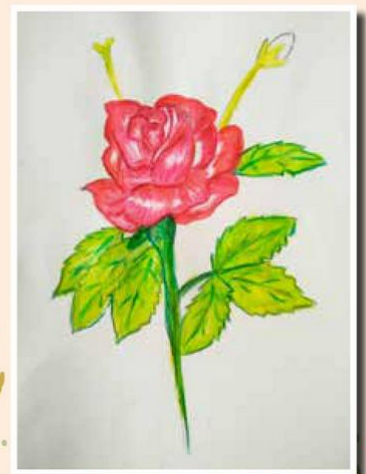
Nissi Sunil X A